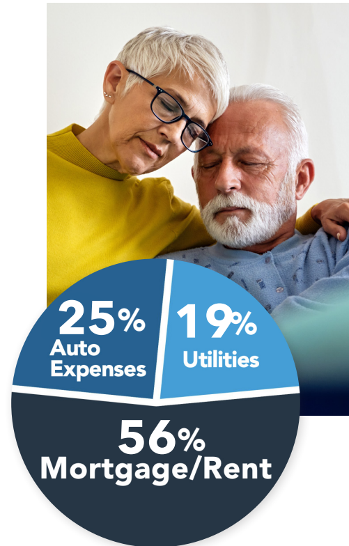
How Patients Use Grants

The FCS Foundation hosts fundraising events throughout Florida to raise money to support our mission. We rely on the support of our volunteers, donors and sponsors to make our life-changing work possible.